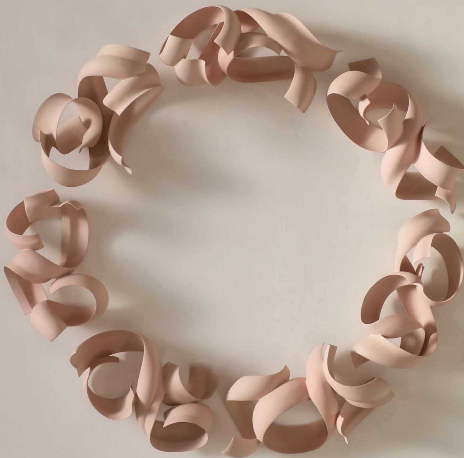
Ring, 127 x 128 x 24 cm (2021)