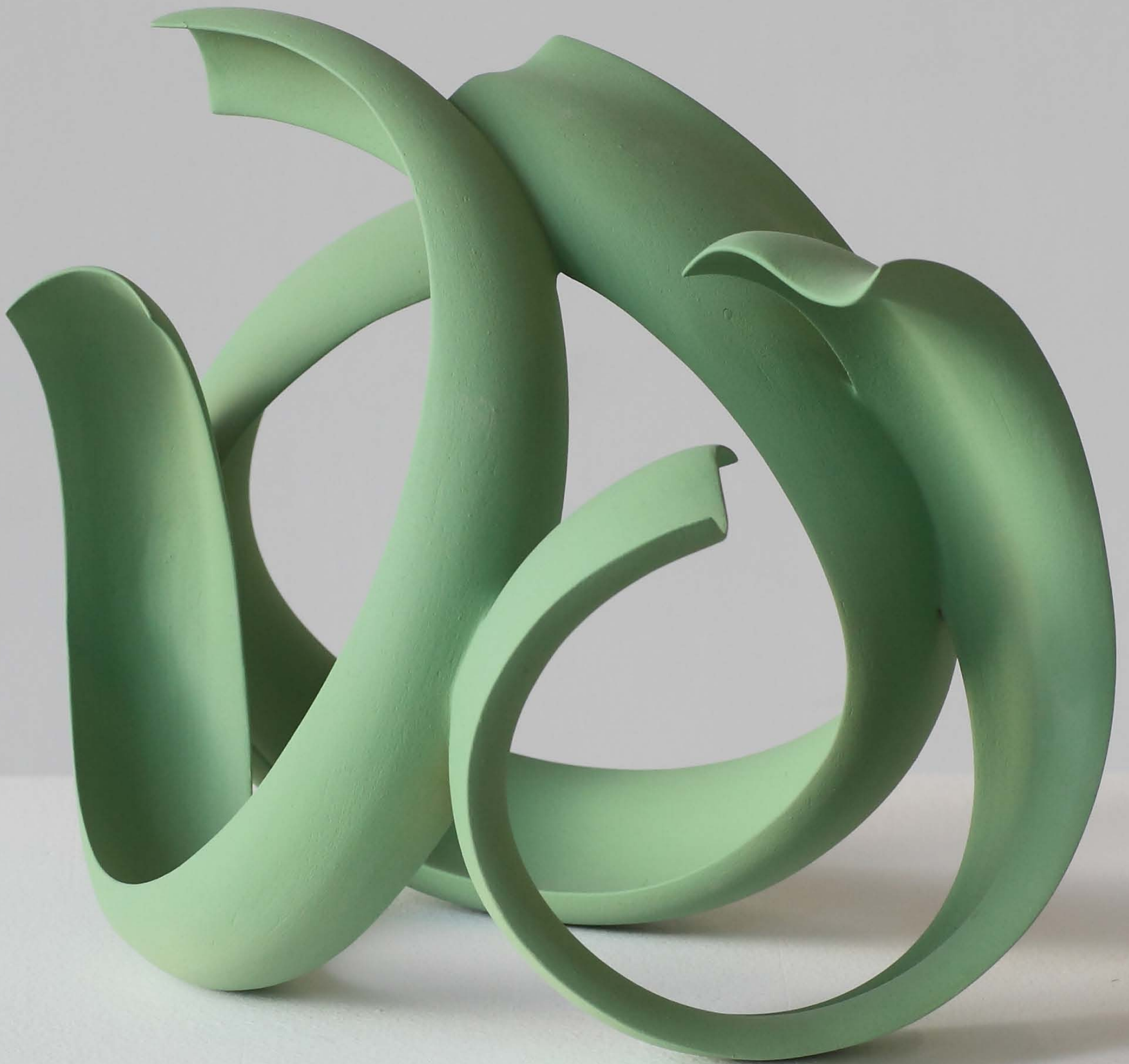
07 Green Sculpture, Wouter Dam, stoneware, 30 x 43 x 30 cm / 12 x 17 x 12 inch (2021)