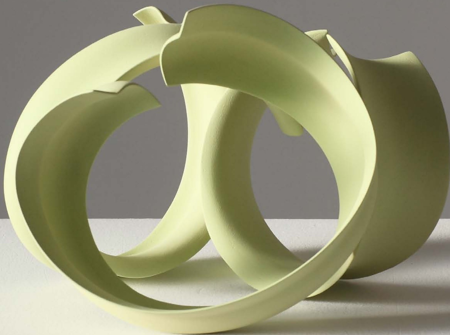
05 Light Green Sculpture, Wouter Dam, stoneware, 25 x 35 x 35 cm / 10 x 14 x 14 inch (2021)