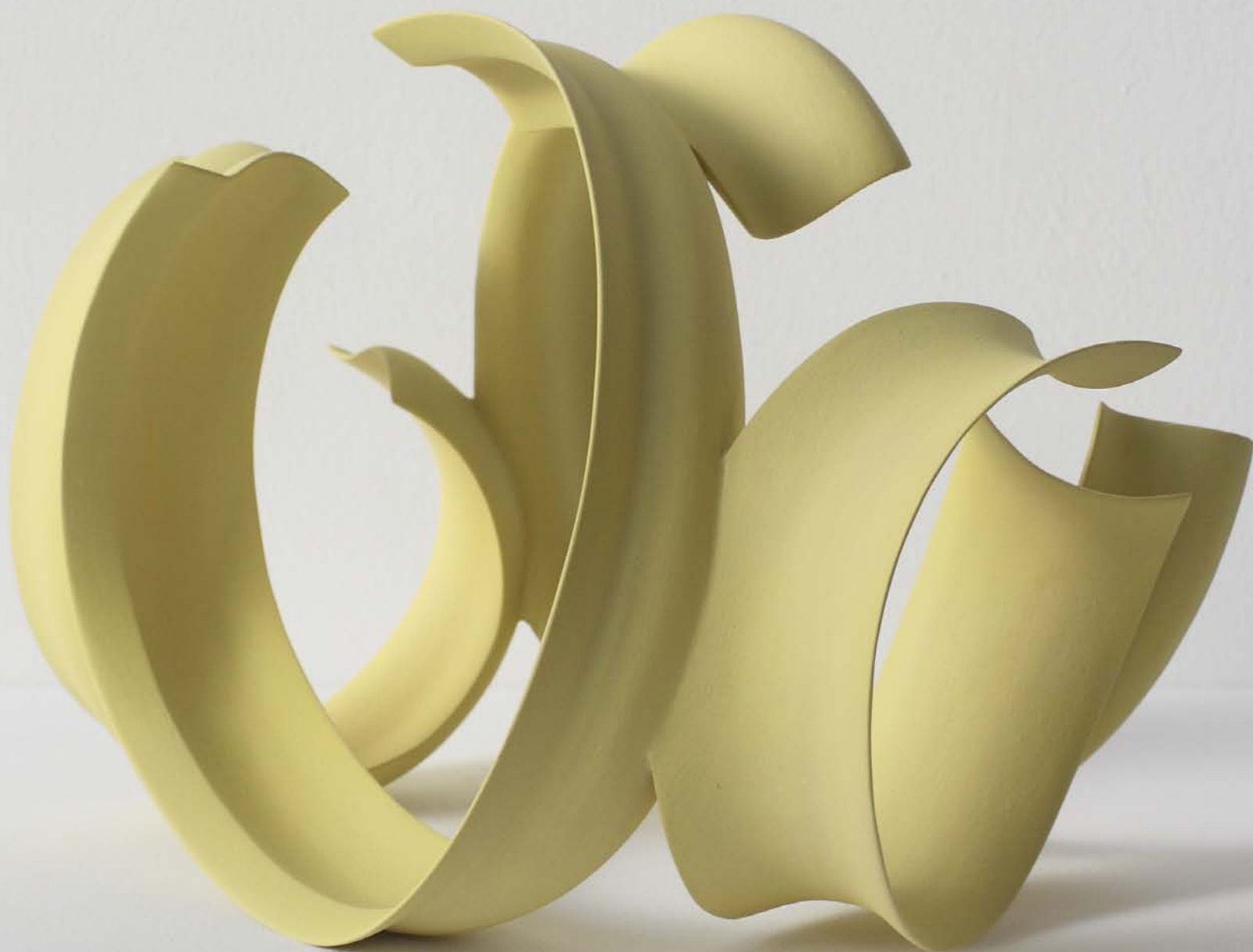
08 Yellow Sculpture, Wouter Dam, stoneware, 31 x 44 x 31 cm / 12.2 x 17.3 x 12.2 inch (2021)