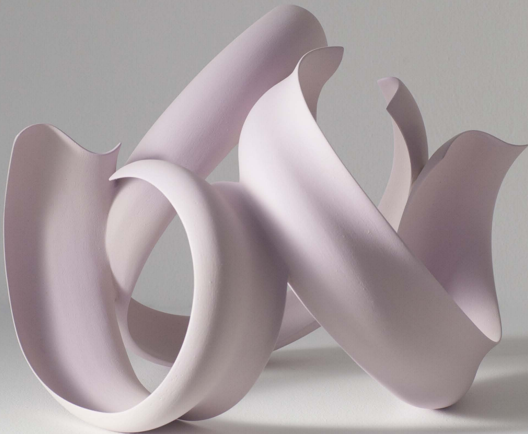
02 Light Purple Sculpture, Wouter Dam, stoneware, 32 x 44 x 33 cm / 12.6 x 17.3 x 13 inch (2021)