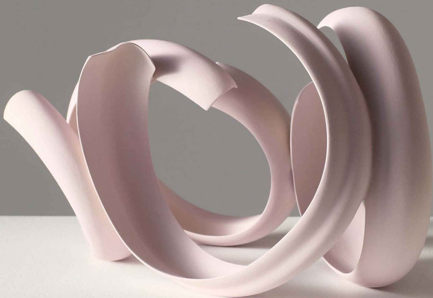
03 Light Purple Sculpture, Wouter Dam, stoneware, 31 x 32 x 34 cm / 12 x 12.6 x 13.4 inch (2021)