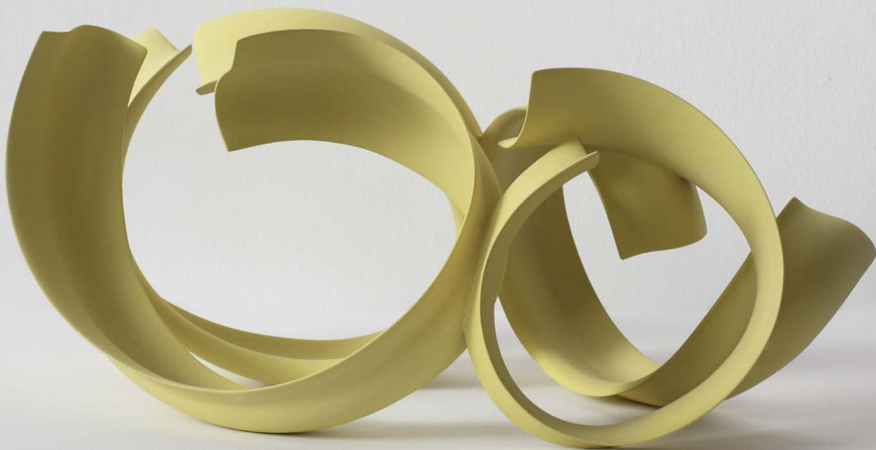
09 Yellow Sculpture, Wouter Dam, stoneware, 26 x 55 x 29 cm / 10.3 x 21.7 x 11.4 inch (2021)