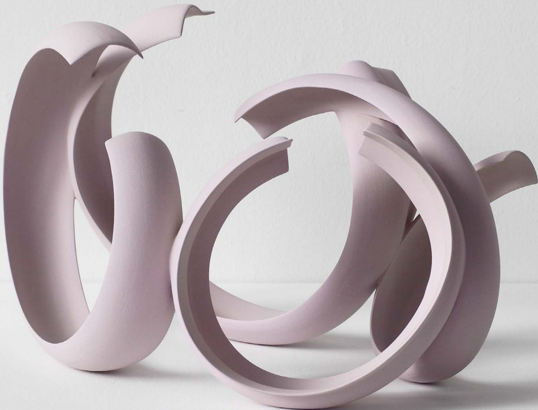
03 Light Purple Sculpture, Wouter Dam, stoneware, 31 x 32 x 34 cm / 12 x 12.6 x 13.4 inch (2021)