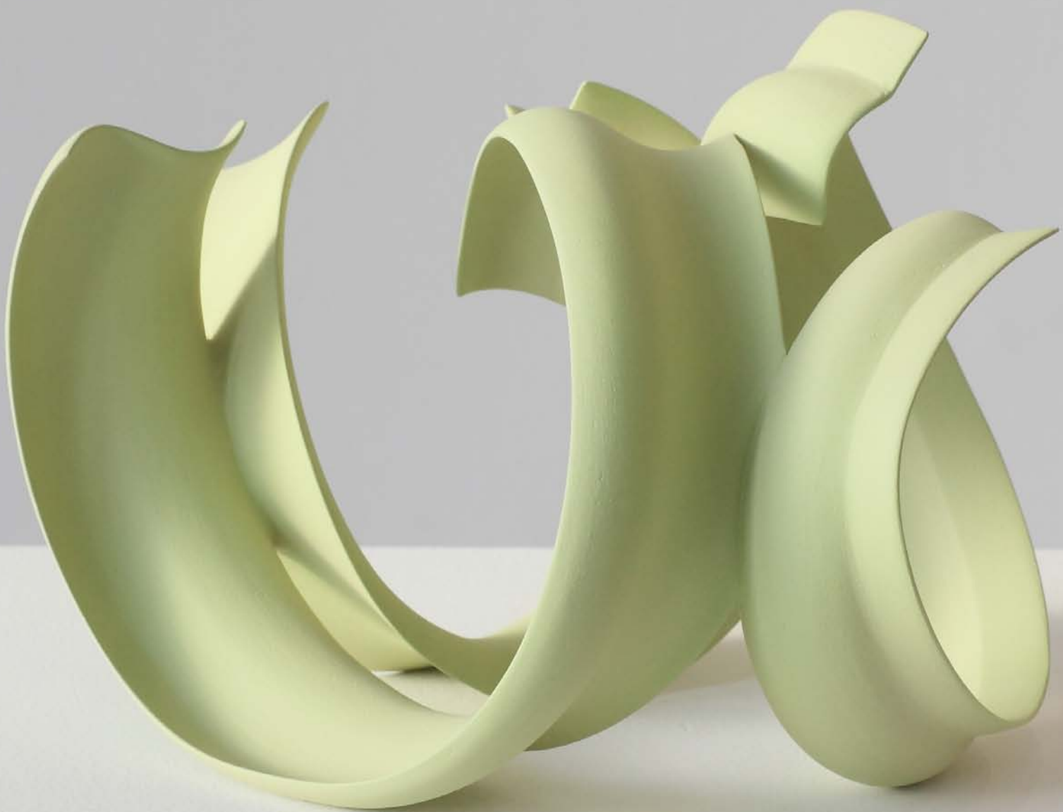
05 Light Green Sculpture, Wouter Dam, stoneware, 25 x 35 x 35 cm / 10 x 14 x 14 inch (2021)