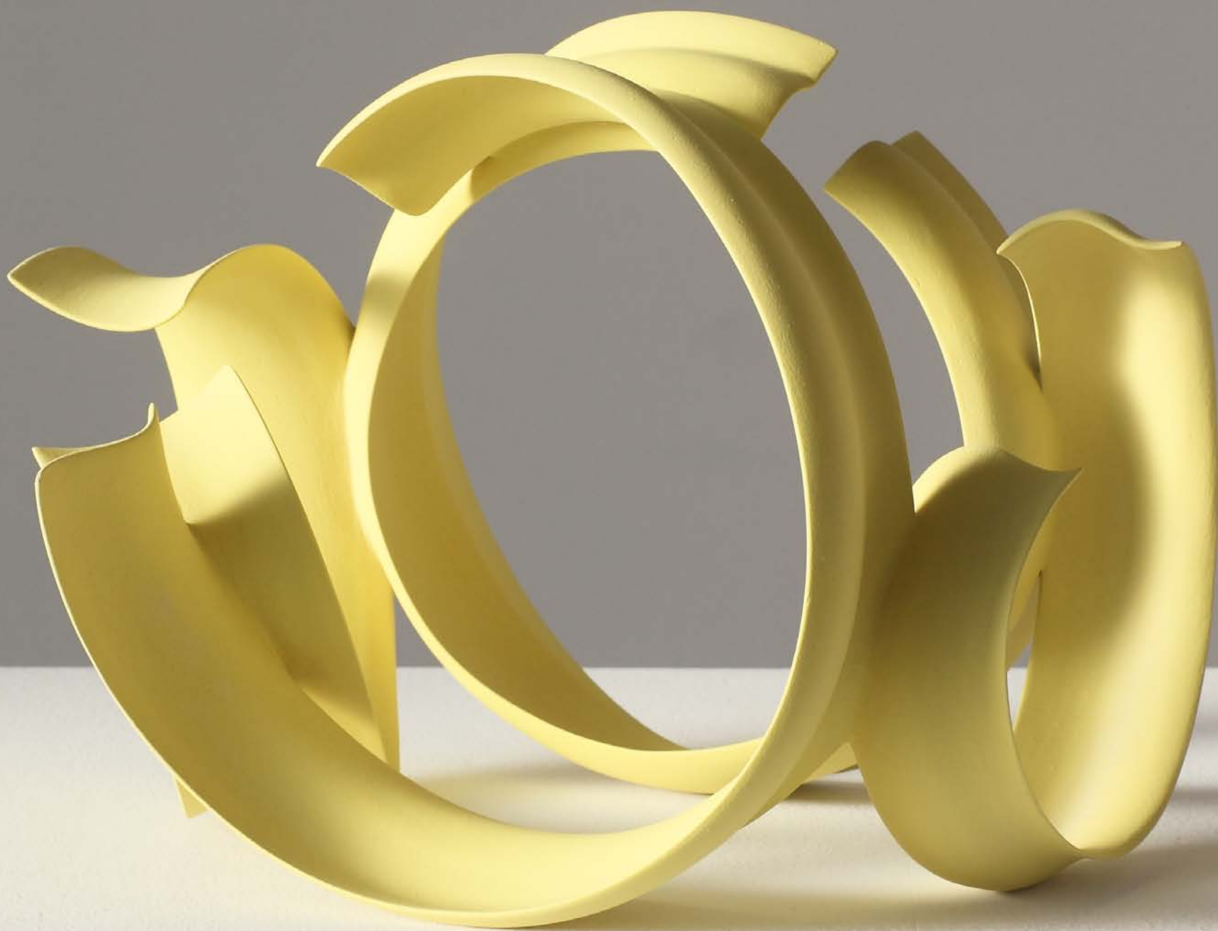
08 Yellow Sculpture, Wouter Dam, stoneware, 31 x 44 x 31 cm / 12.2 x 17.3 x 12.2 inch (2021)