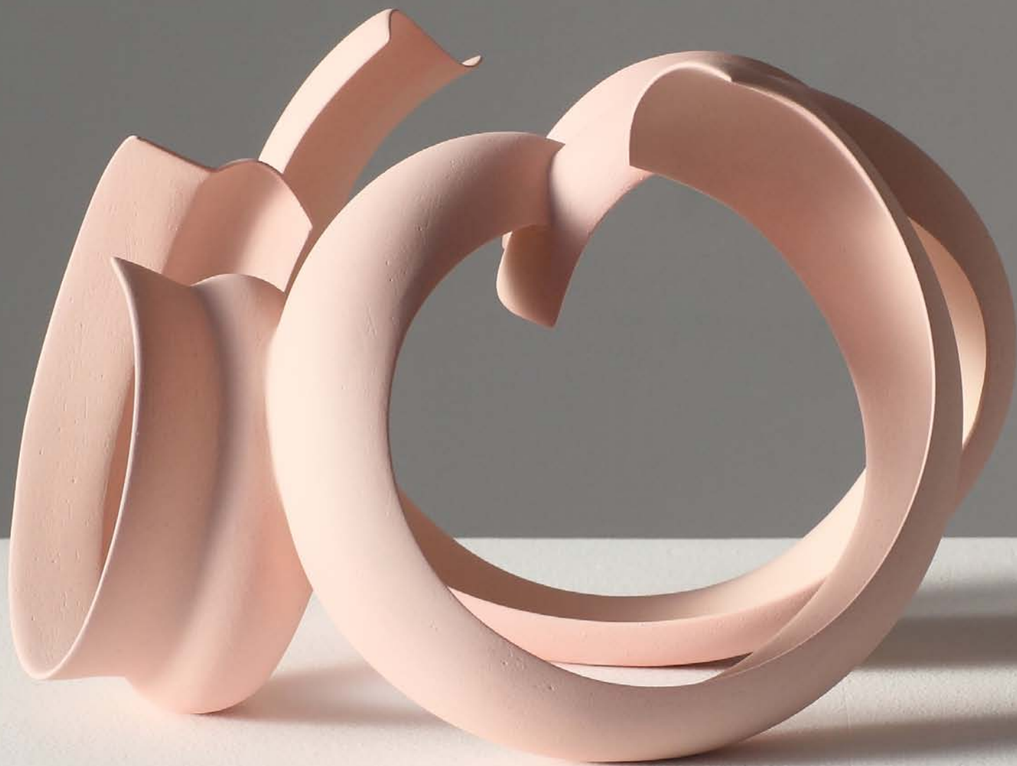
01 Light Pink Sculpture, Wouter Dam, stoneware, 25 x 35 x 30 cm / 10 x 14 x 12 inch (2021)