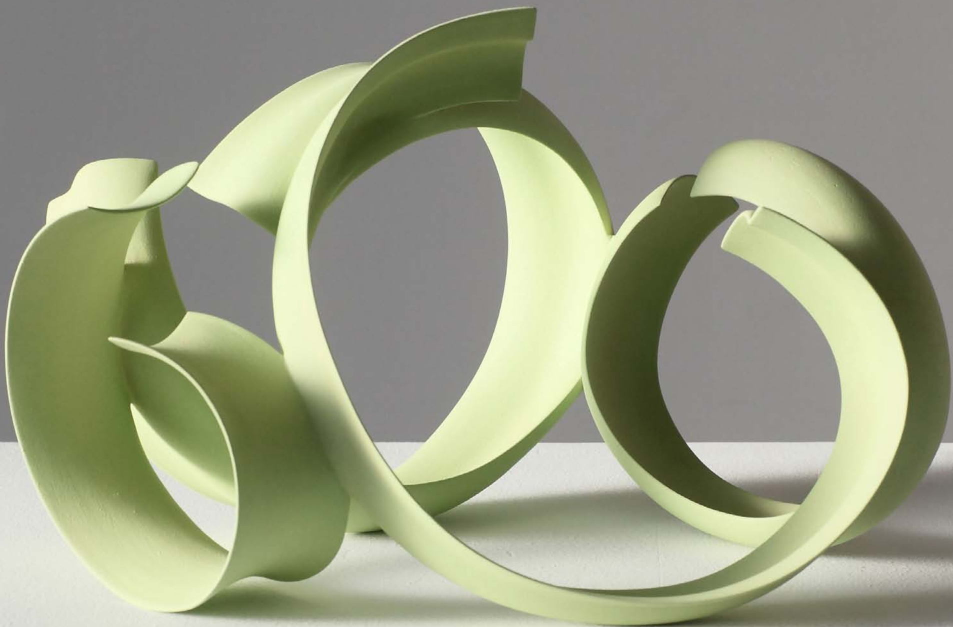
06 Light Green Sculpture, Wouter Dam, stoneware, 28 x 49 x 37 cm / 11 x 19 x 14.6 inch (2021)