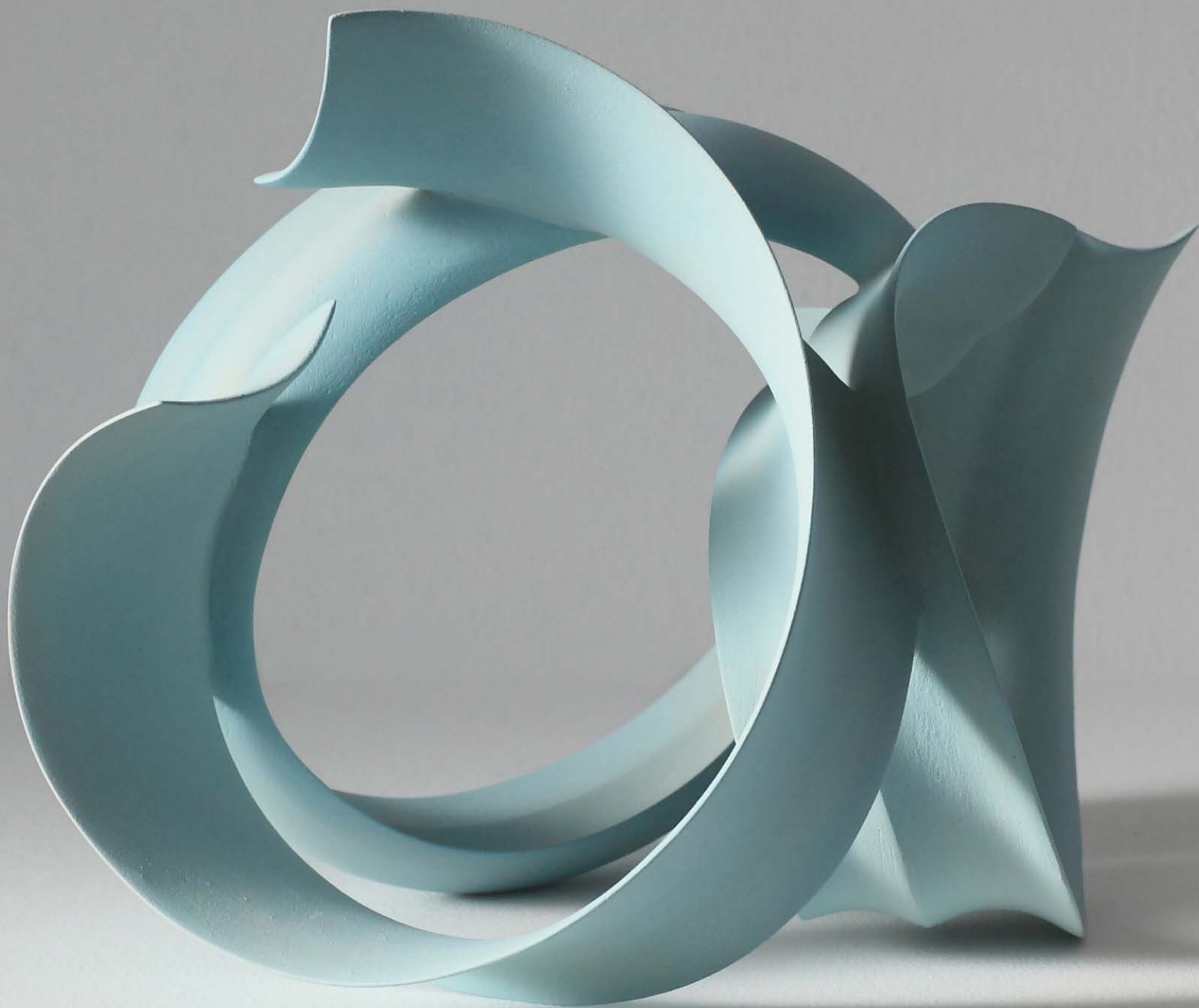
10 Light Blue Sculpture, Wouter Dam, stoneware, 29 x 39 x 27 cm / 11.4 x 15.4 x 10.6 inch (2021)