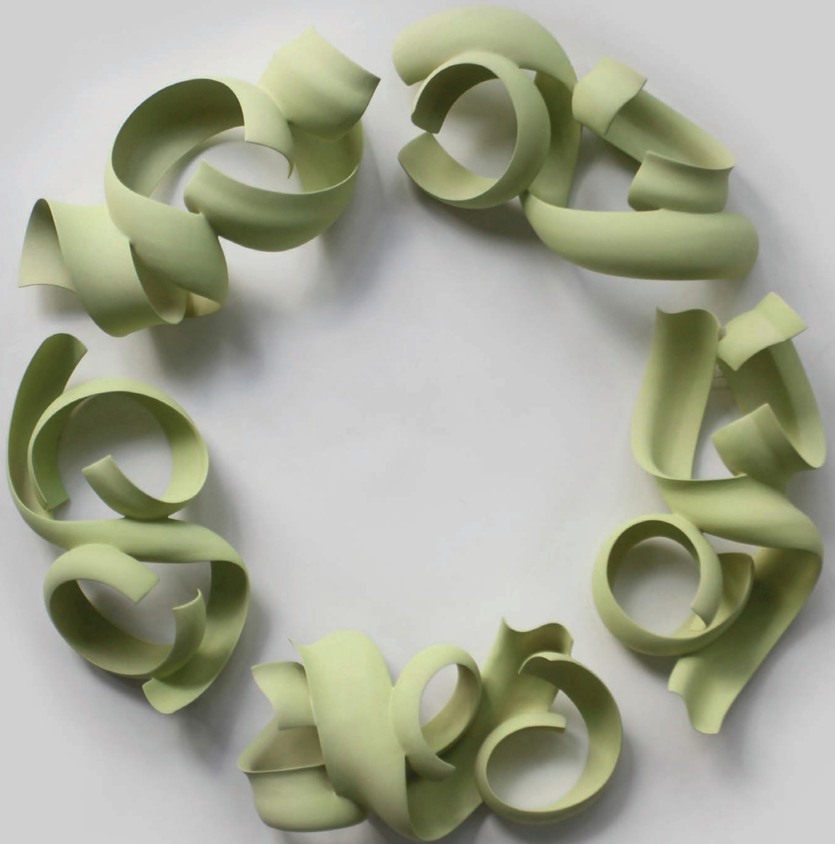
Ring, 107 x 108 x 23 cm (2021)